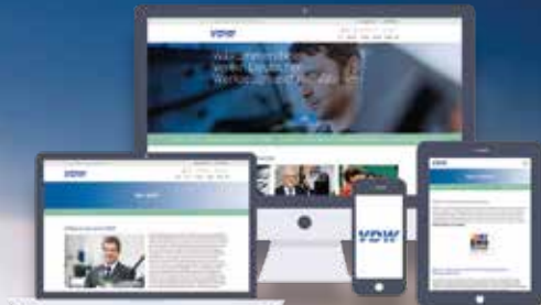
VDW e.V. | Internet portal