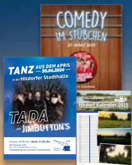
Leben in Hitdorf | City marketing