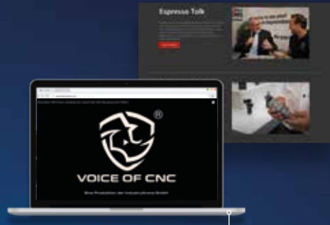
VOICE of CNC | Video podcast