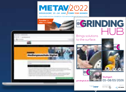
EMO, METAV and GrindingHub | Event marketing