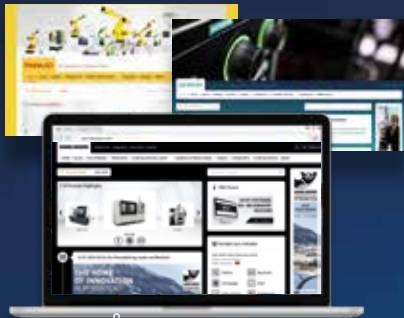
Over 6000 Supplier Microsites