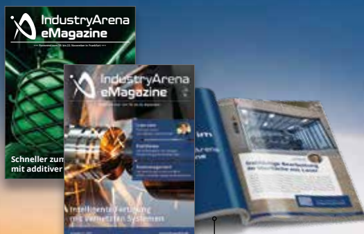
eMagazine | Editorial design